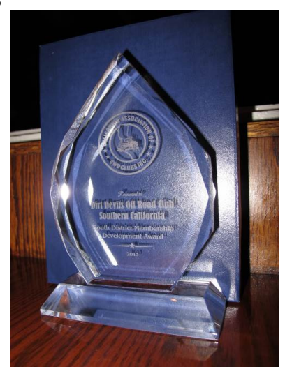
CAL 4 Wheel Drive, new member award